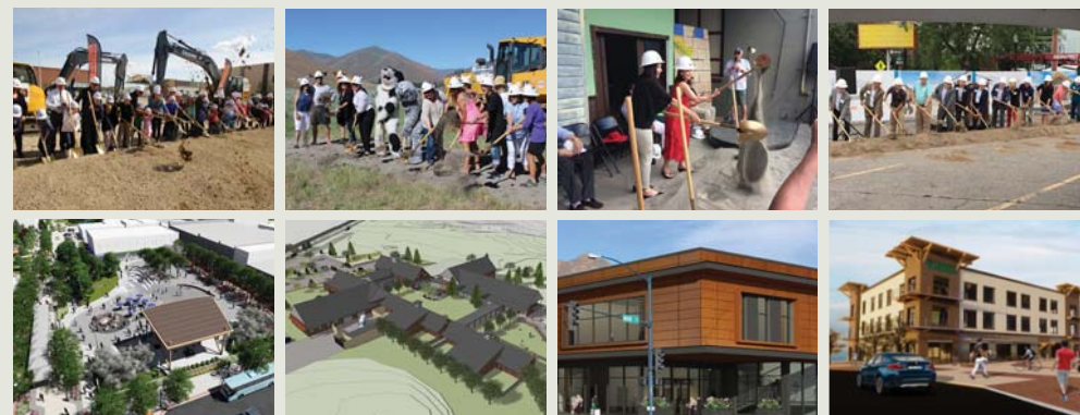
April 10, 2017 - Caldwell, Idaho Indian Creek Plaza

Not every project holds an official groundbreaking ceremony but when they do we like to share a picture! In case you missed any of our latest groundbreaking ceremonies, take a look: